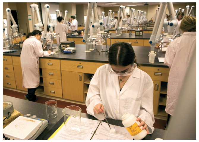
Figure 1. God designed humans to be able to understand the world, including through the scientific method.

Today, most Christians approach the historical sciences to better equip themselves to defend Scripture and refute evolution. As important as this type of equipping