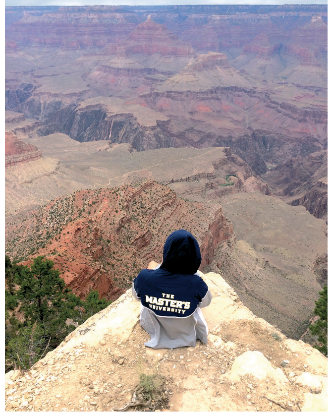
Figure 2. The author on her first trip to the Grand Canyon in Arizona with The Master's University.

A welcome by-product of pursuing a career in the historical sciences is joy and satisfaction. As humans, we are programmed to find joy in God's creation. In doing so we are taking after our creator: God himself delighted in his creation as he created it. Five times Genesis 1 says 'and God saw that it was good' (verses 4, 12, 18, 21, 25). We are commanded to understand and steward our planet and, incidentally, it fills us with joy. Our inbuilt fas-