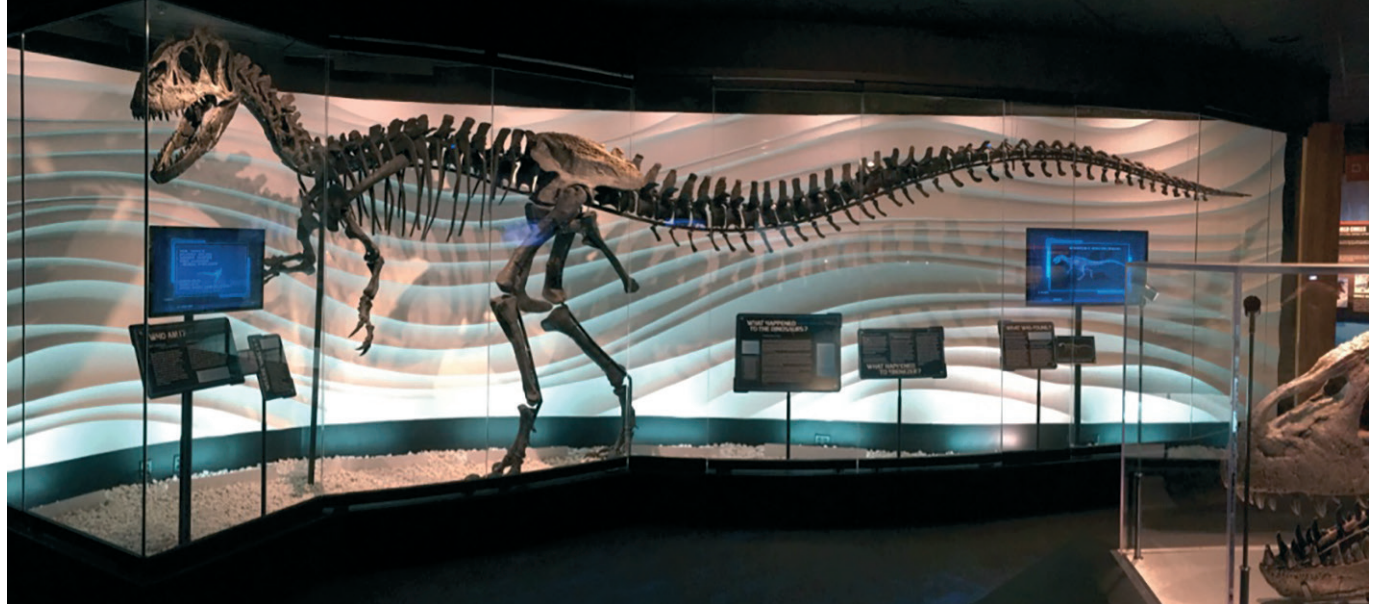
Figure 3. Ebenezer the Allosaurus, on display in the Creation Museum in Petersburg, Kentucky.